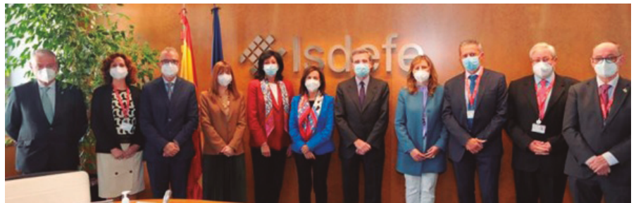
Visit by the Minister of Defence to Isdefe