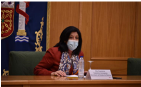
Systems Engineering Congress