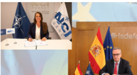
NFP agreement of the NCIA