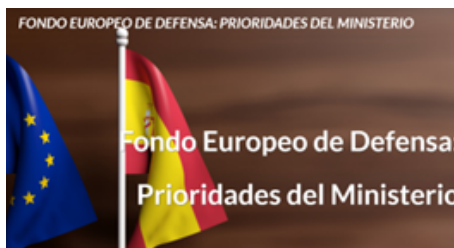
European Defence Fund